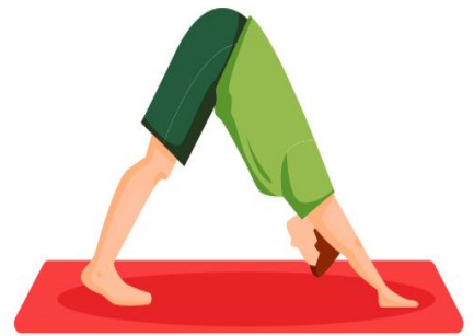
Downward Facing Dog