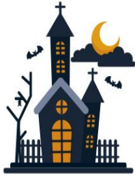
A HAUNTED HOUSE