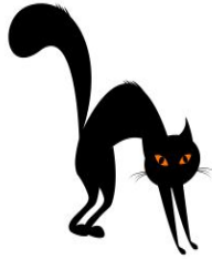
A BLACK CAT