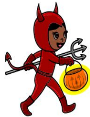
TRICK OR TREAT