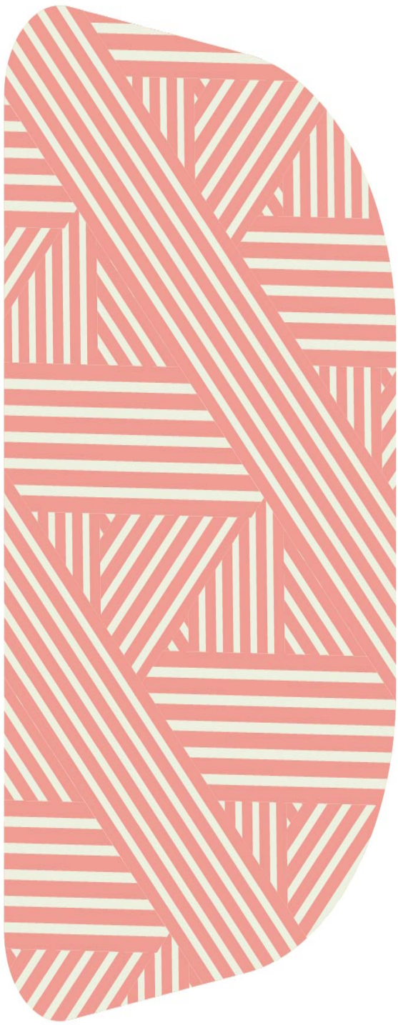
Outer Layer 2x